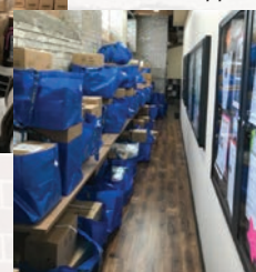
Blue Ikea bags full of PPE supplies.