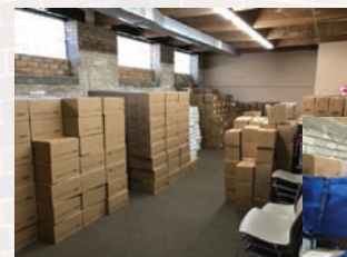
PPE supplies in our classroom.

This was one of the most helpful and fulfilling projects 4C has ever done. We put our masks on and talked to providers as we loaded their vehicles and asked where they were having luck finding cleaning supplies and shared that with other providers as we loaded their vehicles. We asked how they were doing, how their families were doing...it was glorious to be able to connect with the people caring for our children in the most challenging time of all of our lives.