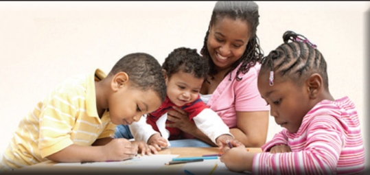
(from DCF Fall provider news)